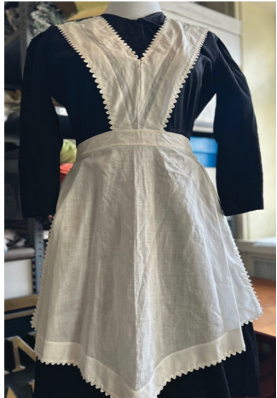
Arms's black cotton maid's uniform with long sleeves and detachable collar and cuffs, c. 1920s. Fine white cotton apron with small bib formed by wide shoulder straps, rick-rack trimming.

On Friday, April 5, the new exhibit, Behind the Scenes: The Servants of Greystone , opened in the second floor hallway of Arms Family Museum. Learn all about who the Arms' servants were, where they came from, and what their jobs were. The exhibit also discusses the general responsibilities of domestic servants, labor laws that impacted domestic servants, factors that influenced the rise and fall of the employment of domestic servants in the country, and statistics on the number of domestic servants employed in Youngstown and the United States from 1900-1960.