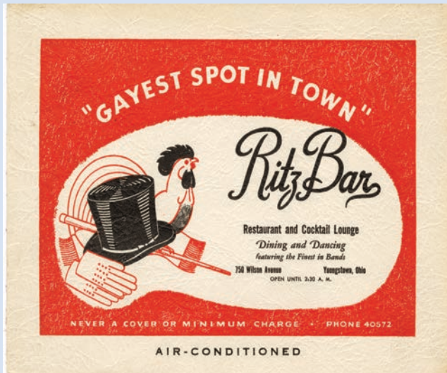
Advertising Cover produced for the Ritz Bar and printed by Abdou Co. of Pittsburgh, PA. MVHS Acc. No. 2024.25.59