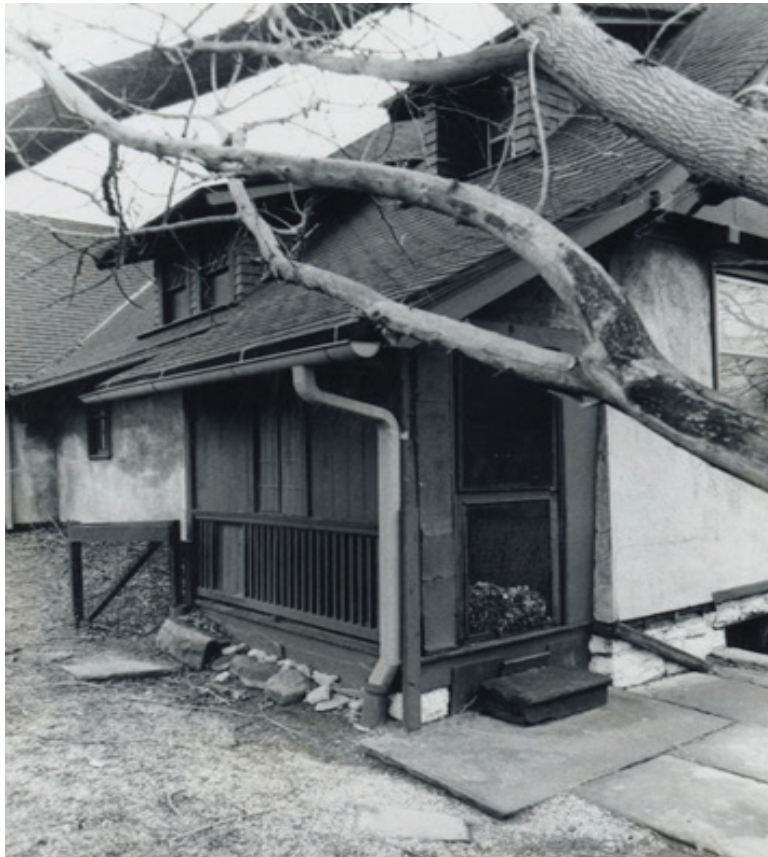
A view of the Arms's carriage house porch, which was located on the southwest corner, 1980. The porch would have been used by the servants.

In the years following the completion of their home, Greystone, in 1905, Olive and Wilford hired several individuals of diverse backgrounds to help care for the three-story house and tend to their personal needs. These individuals filled positions such as housekeeper, butler, maid, cook, waiter/waitress, gardener, chauffeur, and chambermaid. In the duration of their employment, some of the servants resided at Greystone with their families. The cook and the chauffeur lived in the carriage house, while the maids occupied a two bedroom and one-bathroom space on the second floor of the main house. After Wilford's death in 1947, Olive continued to employ domestic servants for assistance. At the time of her own death in 1960, her staff consisted of the chauffeur, a cook, and one maid. Although they worked behind the scenes, the Arms' servants made their mark in Greystone's history.