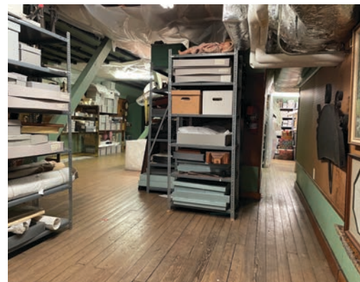
Phase One of the Artifact Relocation project at Arms Family Museum campus resulted in quite a bit of open floor space in the attic of Arms Family Museum.

As noted elsewhere in this edition of Historical Happenings, MVHS members will have their first opportunity to see the interior of the IBM Building, including the developing collections storage center on the third floor, during the Annual Membership Meeting on Tuesday, June 25, 2024. The meeting will include dinner, the election of Board members, and progress reports on programs and institutional priorities. Following the business meeting, recipients of the 2024 Historic Preservation Awards will be honored.